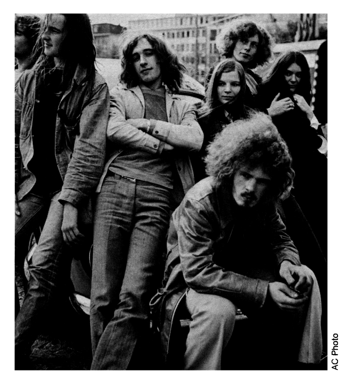
What does the Bible say about long hair?

her for a covering." What is a woman given her for a covering? ______. So the covering of the head talked about in this chapter is hair, and more specifically, the length of the hair. What kind of hair is shameful or disgraceful for a man to have? (See verse 14.) ______. The Greek word for "long hair" means ornamental "tresses of hair." Look up the word tresses in a dictionary and write its definition: