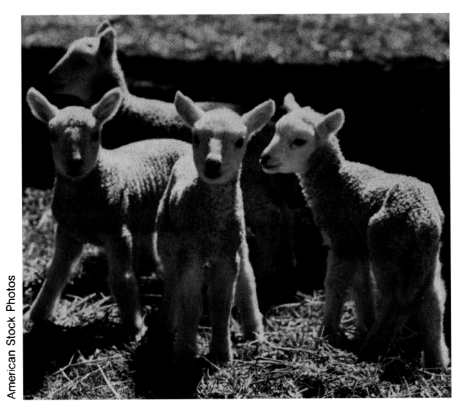
Jesus was called the "Lamb of God."

Now that we understand what Jesus Christ